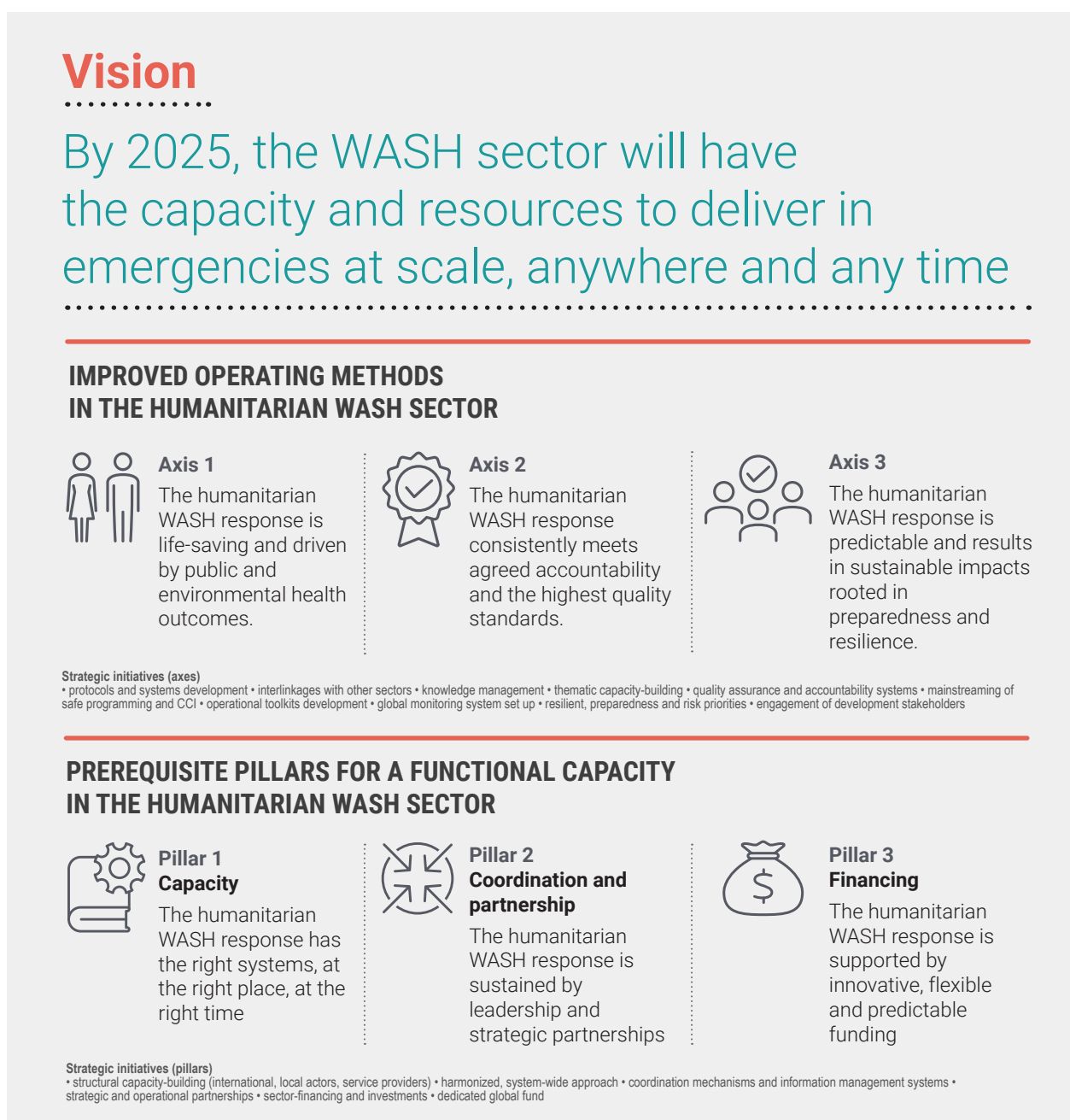
Vision, axes and pillars to deliver humanitarian WASH at scale, anywhere and any time